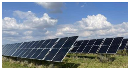
Invenergy’s Hardin Solar Energy Center, located in Hardin County, Ohio.

Commits to developing projects while minimizing impacts to sensitive ecological resources and ensuring responsible land use